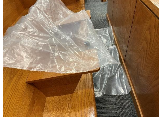
General view of work area in Courtroom 2.