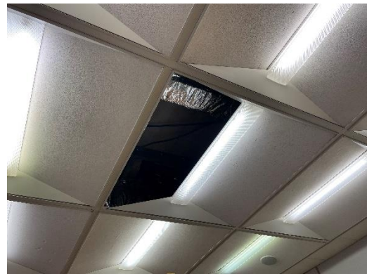
View of Courtroom 1 after abatement of mould-impacted ceiling tile.