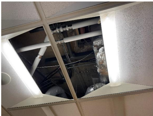
View of Courtroom 2 after abatement of water-stained ceiling tiles.